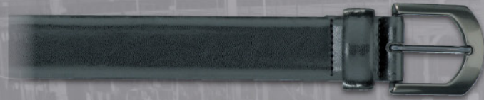
11101 SZ: 30-44 04-BLK 35MM Antique finish glazed leather to glazed bonded leather lining with a black nickel buckle