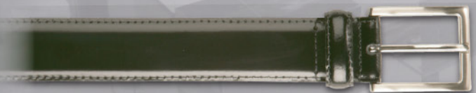
11218 SZ: 32-44 04-BLK, 11-TAN 35MM Grooved square tip basic