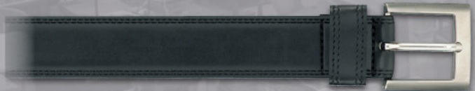
11129 SZ: 30-46 04-BLK, 13-DK BRN 35MM Smooth glazed bonded leather to leather lining with a double stitched center padding, finished with a satin nickel buckle. Also available in oversize.