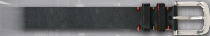
11300 SZ: 32-44 0409-BLK/WHT, 0472-BLK/ORG 0904-WHT/BLK, 0972-WHT/ORG THE V-TWIN 38MM heavy weight shrunken leather finished with a matching wip stitch and keepers